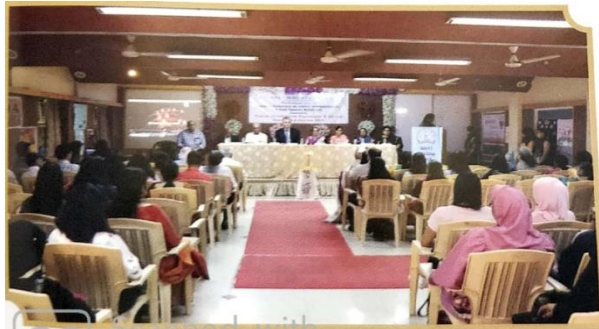
Scanned with CamScanner National Conference on Family Empowerment : "Path Towards Better Life "