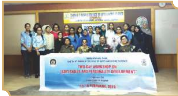
Two Day Workshop on Personality and Soft Skill Development