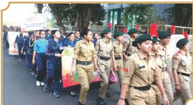
Students participating at the Ek Bharat Swasth Bharat Rally