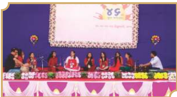
46th Yuvak Mohotsav, VNSGU