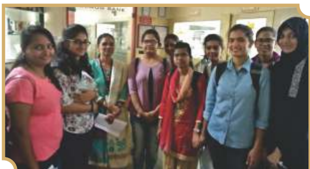
Microbiology Students Visited Surat Raktadan Kendra