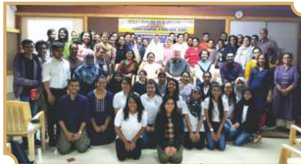
International Workshop on “Combining Mindfulness and CBT”