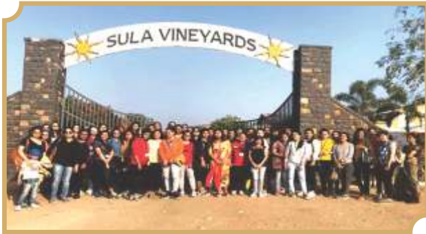
Visit to Sula Vineyard