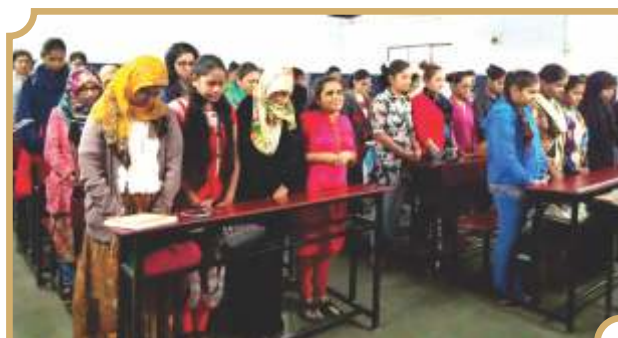
Gandhi Nirman Divas was observed by Arts Faculty Students