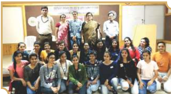
Student Council at the Oath Taking Ceremony