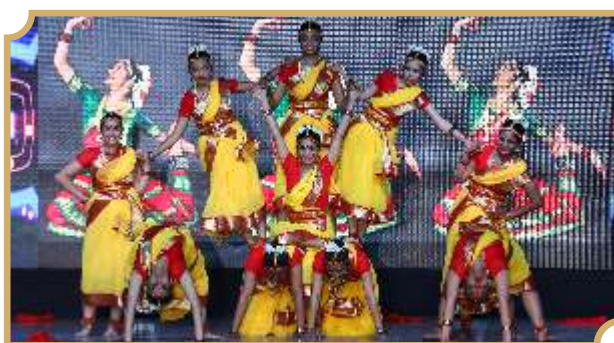
South Indian Folk Dance at the Annual Function