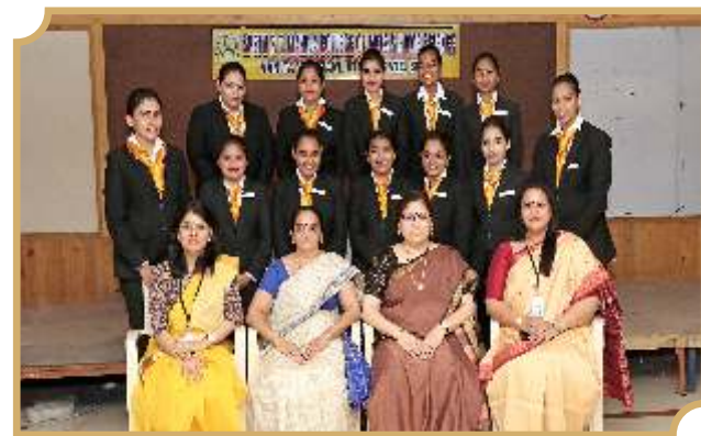
Department of Hospitality Management