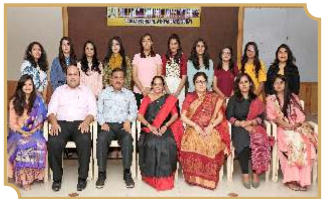
PG Diploma in Dietetics