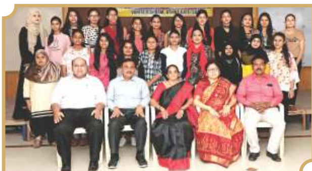
Department of Gujarati