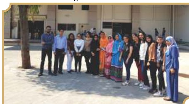
Industrial Visit to Sumul