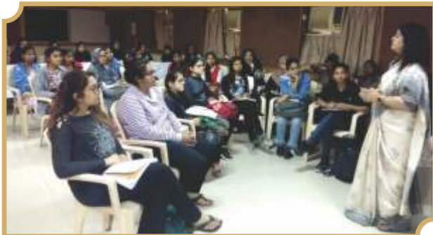
One Day Workshop on Public Speaking and Interview Techniques