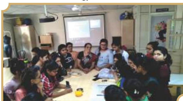
Workshop on "Entrepreneurial Skill Development