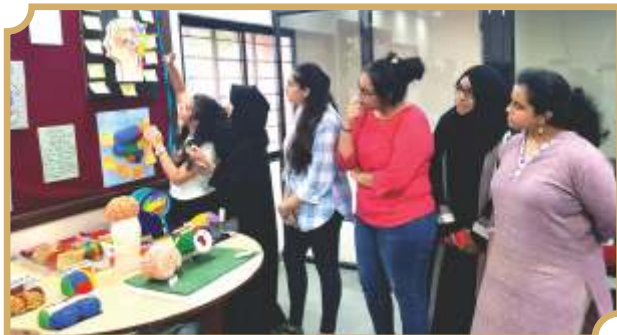
Brain Week Celebration