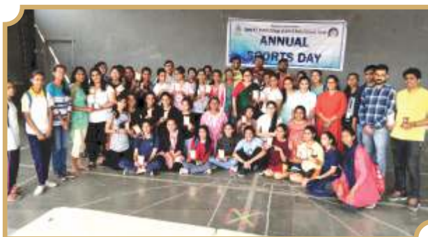
Winners at the Annual Sports Day