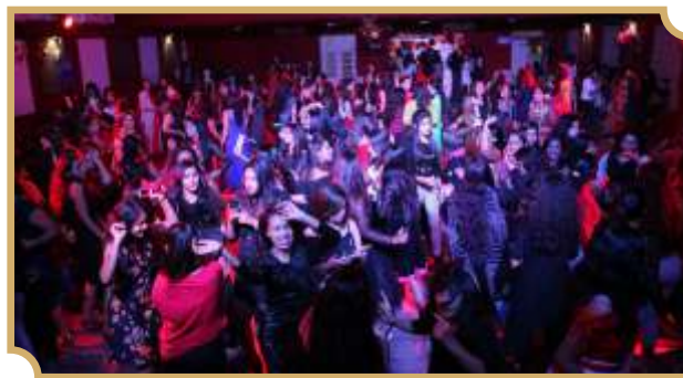
New Year Celebration