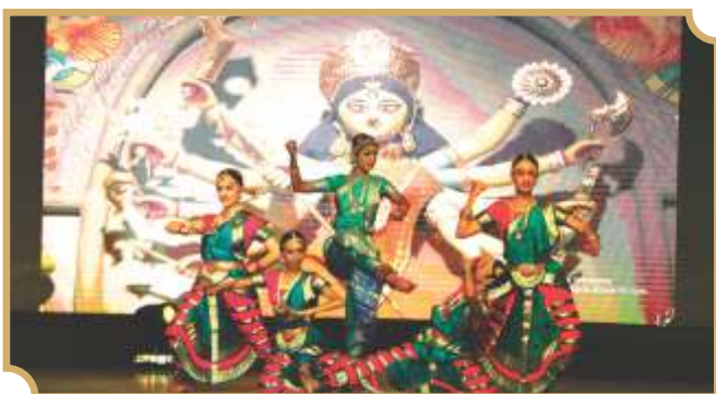
Classical Performance at the Annual Day Celebration