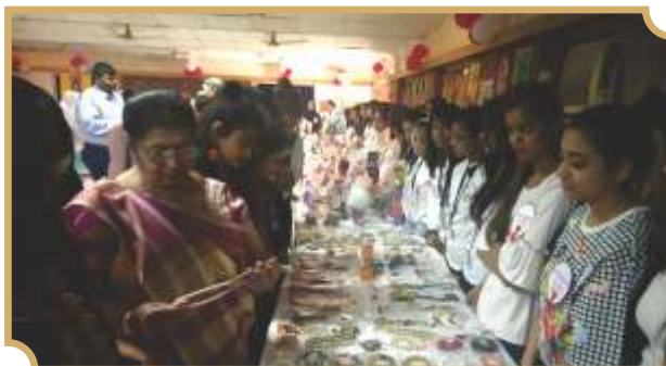
Entrepreneurial Exhibition Cum Sale, Vibgyor 2019