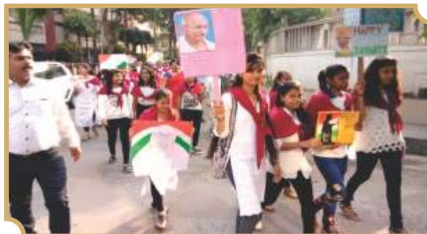
Poster Making on "Mahatma Gandhi Jivan Ghadtar" & Rally