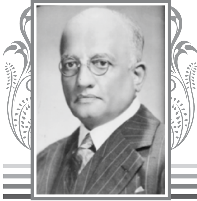
Sheth Purshottamdas Thakurdas