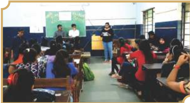
Narmad Janma Jayanti Celebration