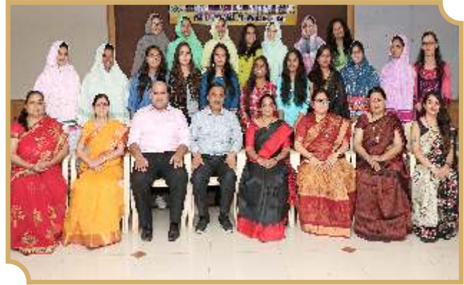
Department of Human Development