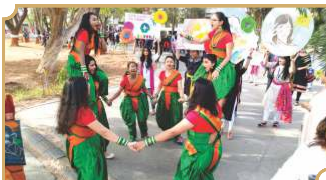
Participation in Kala Yatra at Yuvak Mahotsav, VNSGU