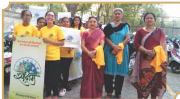
Training Awareness on Conservation of Energy