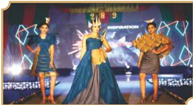
Srizan - Fashion Show at Annual day celebration