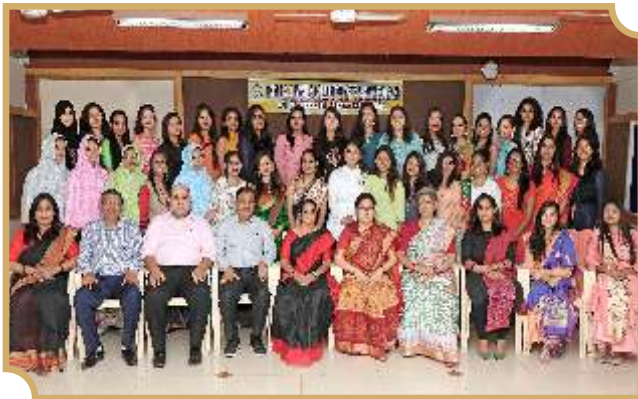
Department of Food Science & Nutrition