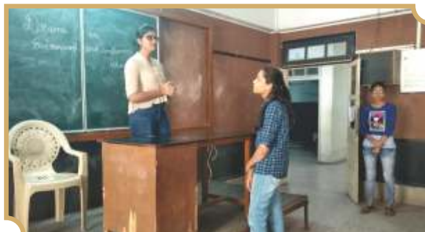
Dramatization on Environmental Issues