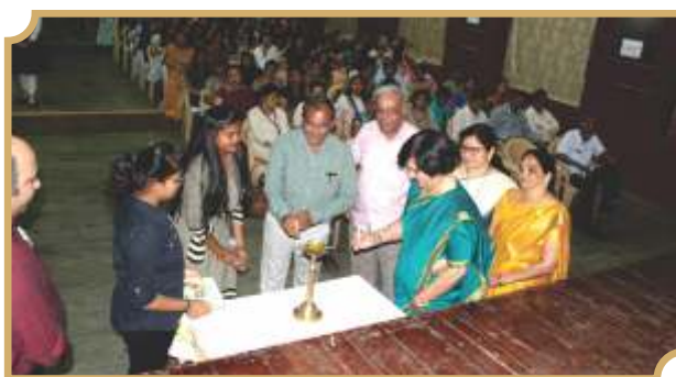
Lamp Lighting at Annual Prize Distribution