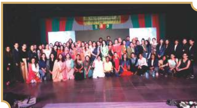
Cultural Committee and Students at Annual Function