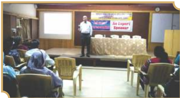
Guest lecture on Food Product Development