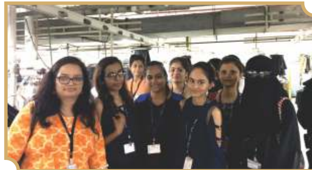
Visit to Banswara