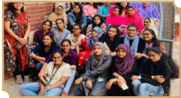
Visit to Surat Fort