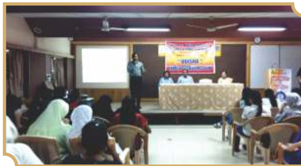
Program on Awareness of Government Jobs and Competitive Examination