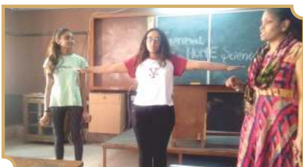
Dramatization on Various Consumer Issues