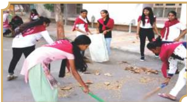
College Campus Cleaning