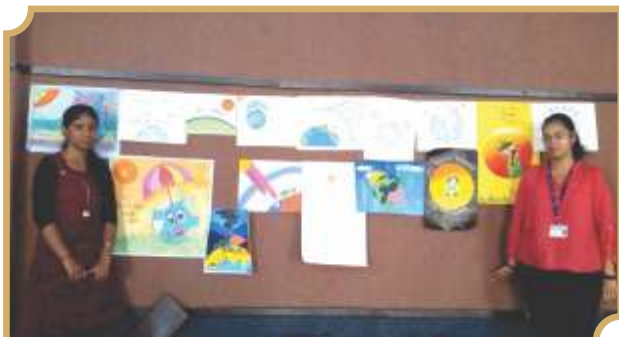
Celebration of World Ozone Day-Poster Competition