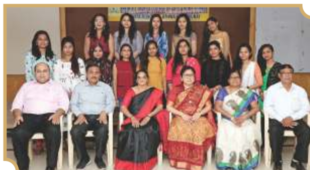
Department of Hindi