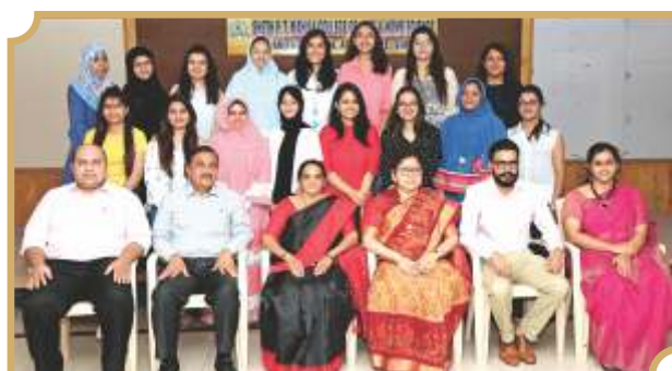
Department of Psychology