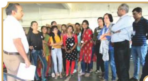
Visit to Sardar Vallabhbhai National Institute of Technology