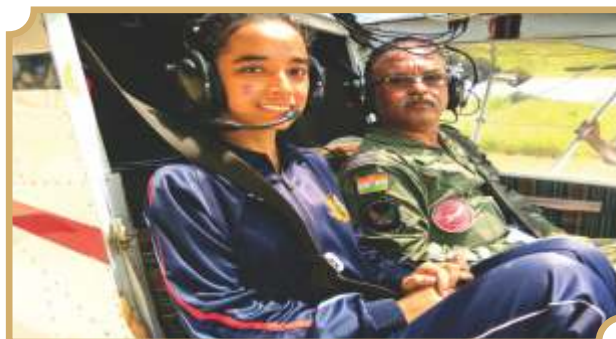
Flying Camp Baroda