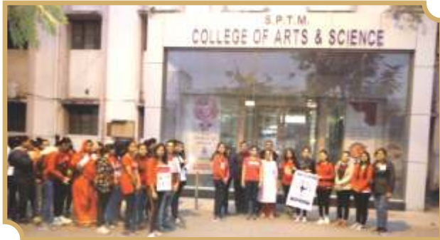
Dietetics Day Celebration