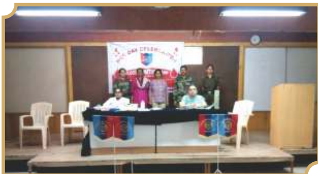
NCC Day Celebration