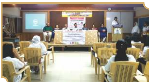
One – Day Workshop on “Password to myself”