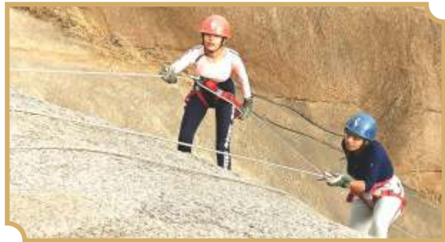
Rappelling at Polo Forest