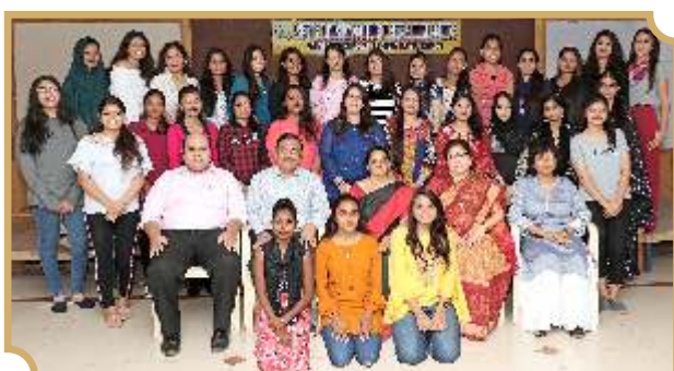
Department of English