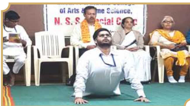
Yoga and Pranayam Awareness Program by Gayatri Pariwar