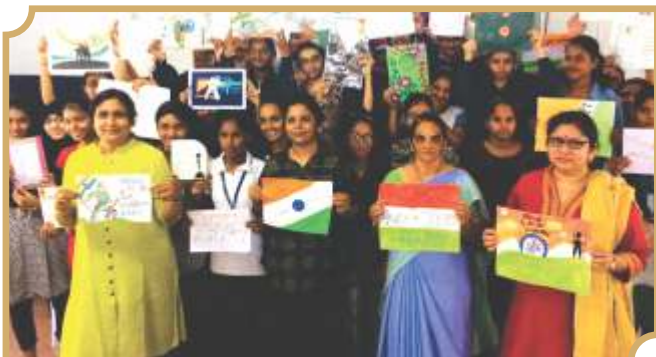
Poster Competition on Surgical Strike Day