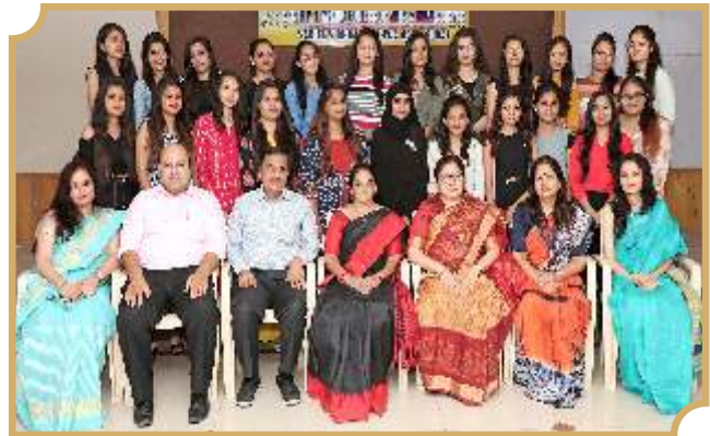
Department of Apparel Design