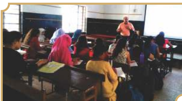
Workshop on Phonetics for TY B.Sc. Students -11 th Aug. 2108