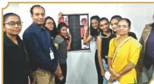
Poster Competition on Electron Microscopy