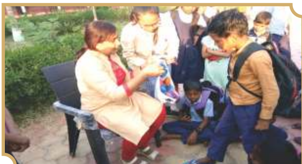
Footwear Donation to the School Children at Saroli Primary School