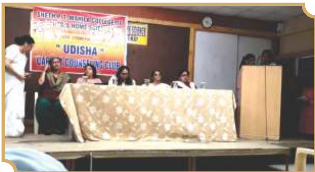
Seminar on Career Counselling by Planet Education