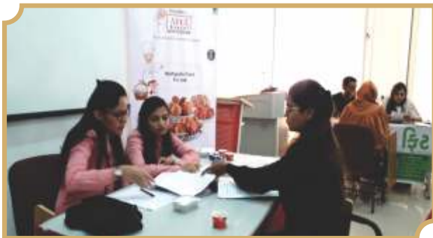
Mega Placement Fair by KCG and Higher Education of Gujarat