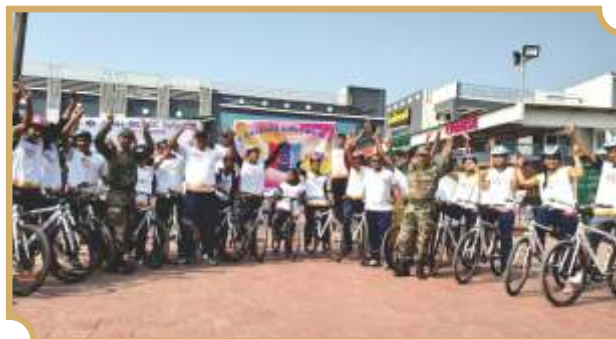
Cycling Rally - Surat to Bharunch