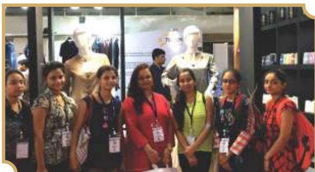
Visit to Yarn Expo