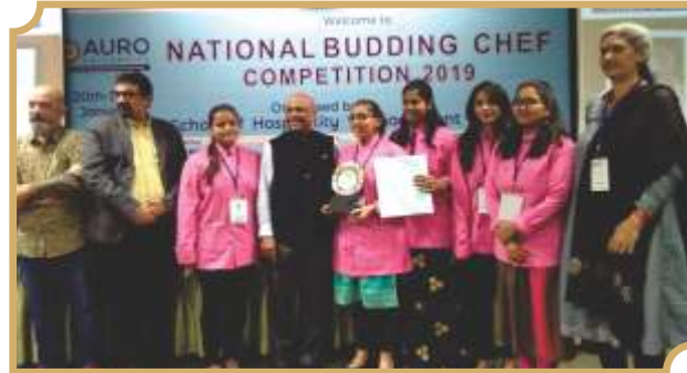
Participation at National Budding Chef Competition