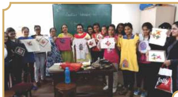
Workshop by Fevicryl