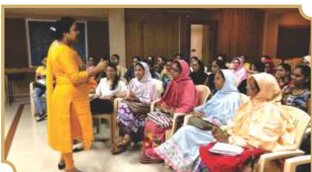
Story Telling Workshop