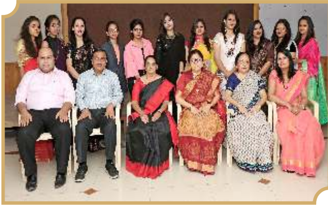
Department of General Home Science