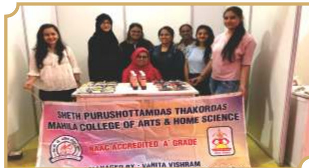
Students Exhibiting Food Products at Food Mech Asia 2019