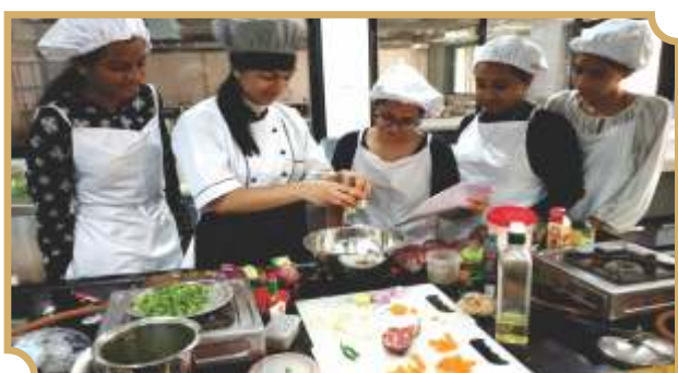
Techniques of Cutting and Chopping