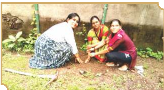
Tree Plantation in the College Campus