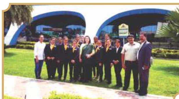
Visit to Surat Airport