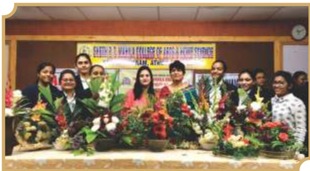
Floral Decoration Workshop