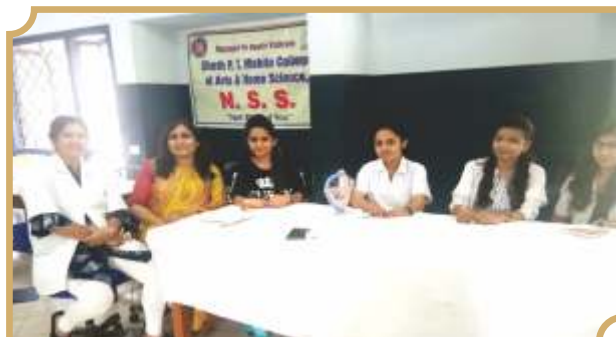
General Medical Check up & Thallasemia Health Check up Camp for our College Students